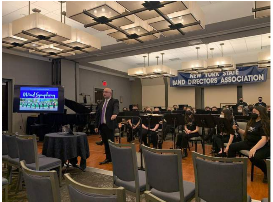
Nazareth College Wind Symphony, Symposium 2022