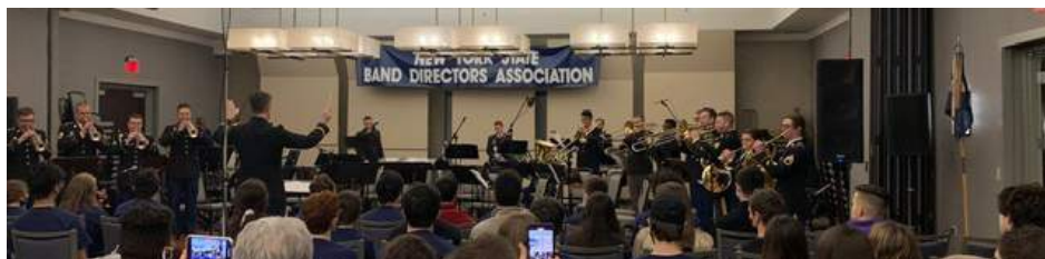
New York 42nd Infantry Division Band, Symposium 2022