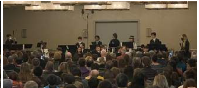
2022 Jazz Ensemble Honor Band