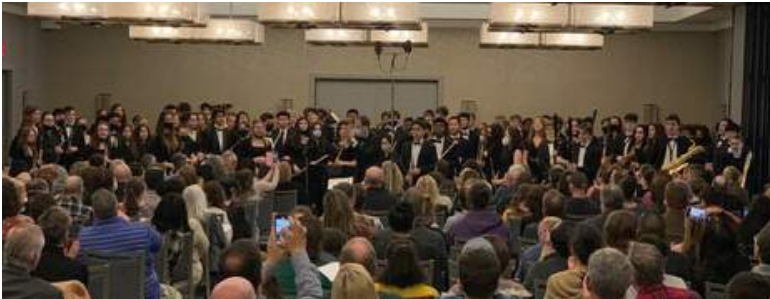
2022 High School Honor Band