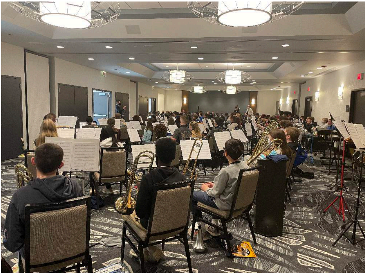
2022 Middle School Honor Band