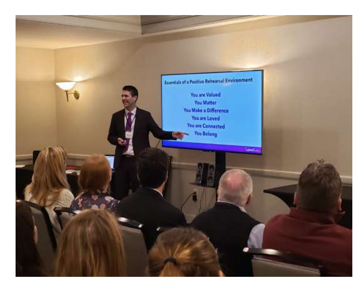
Dr. Arau Clinic, Symposium 2024